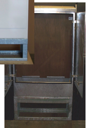
Treated 18mm Plywood Back, Side & Light Boards